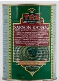
TRS Sarson Ka Saag - 539 (6x850g); 61(12x450g)