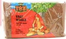
TRS Ragi Whole - 1841 (6x750g)