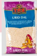
TRS Urid Daal 359,627 (10x1Kg); 10 (20x500g); 68(6x2kg)