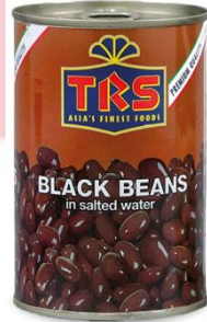
TRS Canned Black Beans – 1416 (12x400g)