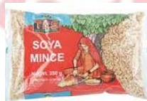
TRS Soya Miced - 287 (10x250g)