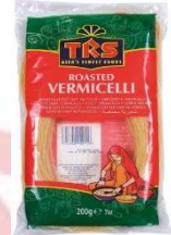
TRS Rice Vermicelli - 529(15x200g)