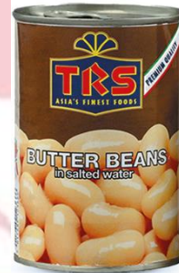
TRS Canned Black Eye Beans - 1025(12x400g)