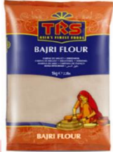
TRS Bajri Flour - 1377(10x1kg)