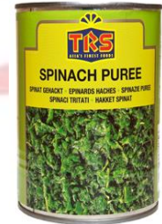
TRS Canned Spinach Puree - 526 (12x400g); 907(12x800g)