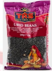
TRS Urid whole black 2028 (10x1Kg);250 (20x500g); 42(6x2kg)