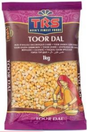
TRS Toor Daal - 40(20x500g); 378(6x2kg);1542 (10x1kg)