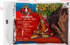
TRS Tukmaria - 595 (20x100g) Kasa Kasa