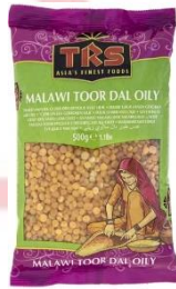
TRS Toor Daal (Oil) - 620(20x500g)