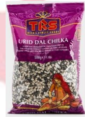
TRS Urid Daal chilka 2033 (10x1Kg);254 (20x500g); 128(6x2kg)