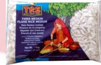
TRS Rice Flakes Medium Pawa - 293(20x300g); 117(6x1kg); Thick pawa(1970)