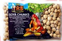
TRS Soya Chunks - 332 (10x250g); 282(6x500g);823( 6x750g)