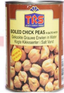
TRS Canned Boiled Chick Peas (Kichererbsen) - 1 (6x800g); 218(12x400g);2145 (6x2.6kg)