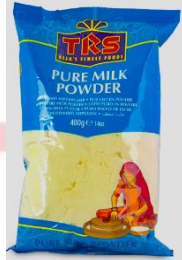
TRS Milk Powder - 322(10x400g); 1726(6x1kg)