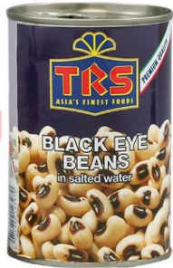
TRS Canned Black eye Beans - 1025(12x400g)