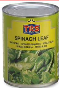
TRS Canned Spinach Leaves - 1316 (12x400g); 1353(12x800g)