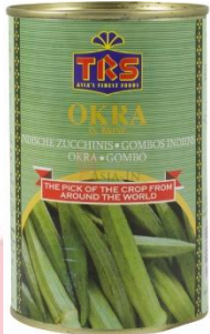
TRS Okra Tin - 1971(12x400g)