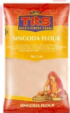
TRS Singoda Flour – 2032 (10x1kg)