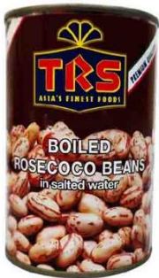
TRS Canned Boiled Rosecoco Beans - 1572(12x400g)