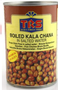
TRS Canned Kala Chana (Braune Kichererbsen) - 688 (12x400g)