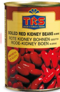
TRS Canned Red Kidney Beans - 671(12x400g)