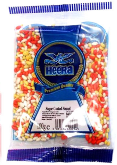
Heera Sugar Coated Fennel 20x100g - 1151