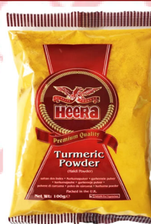
Heera Haldi Powder (Kurkuma) 20x100g - 1134