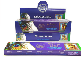
Heera Krishna Leela Agarbatti 12x15g - 1704