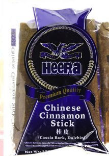
Heera Dalchini 10x200g - 2326