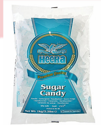
Heera Lump Sugar (Kalkandu) 20x100g – 1227;20x300g-1227-1