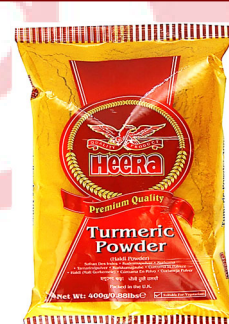
Heera Haldi Powder (Kurkuma) 10x400g - 1228