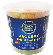
Heera Gooor Indian (Jaggery) 20x450g - 1178