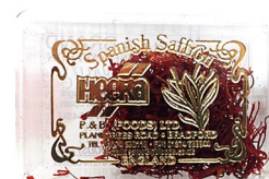
Heera pure Safran 12x2g - 1699; 12x1g - 1284