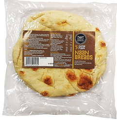
Heera Plain Nan 12x440g - 1645