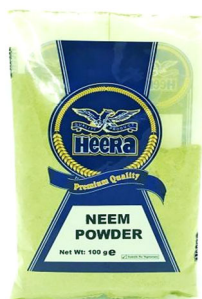
Heera Neem Powder 20x100g - 1282