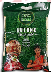
Heera Idli Rice 2x10 kg - 1205