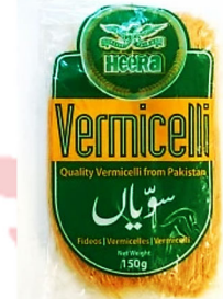
Heera Semiya (Vermicelli) 48x150g - 1280