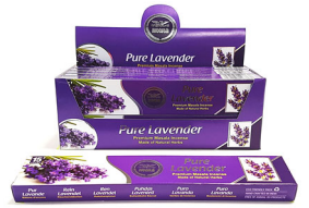
Heera Pure Lavender Agarbatti 12x15g - 1705