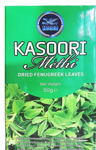
Heera Methi Leaves 6x1kg - 1217