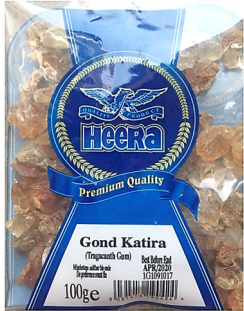
Heera Goond Katira 20x100g - 1902