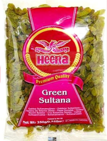
Heera Raisin Green Sultana 20x100g - 1264