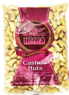
Heera Cashew Nuts 20x300g - 1221