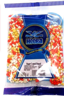
Heera Sugar Coated Fennel 20x300g - 1151-1