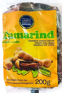
Heera Tamarind With Seed 48x400g -