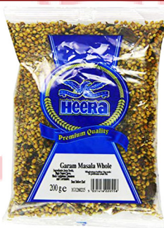
Heera Garam Masala Whole 20x200g - 1424