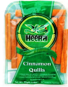
Heera Dalchini Cinnamon Sticks 20x50g - 1255