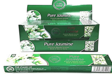
Heera Pure Jasmin Agarbatti 12x15g - 1703