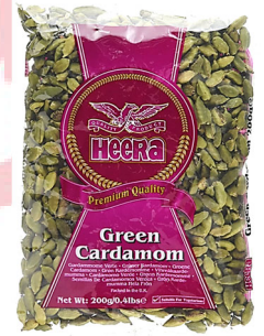
Heera Cardamon Green 20x50g - 1208; 20x50g - 1212