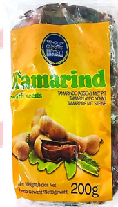
Heera Tamarind With Seeds 50x400g - 784-3