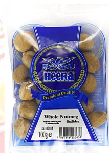
Heera Nutmeg Whole 10x100g - 1551