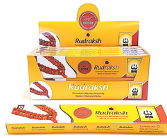
Heera Rudraksh Agarbatti 12x15g - 1897; 1708