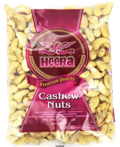
Heera Cashew Nuts 20x100g - 1222