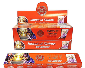
Heera Jannat Ul Firdous Agarbatti 12x15g - 462