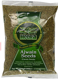
Heera Ajwain (Königskümmel) 10x300g - 1223