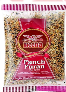
Heera Panch Puren 20x100g - 1209