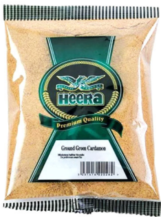
Heera Cardamon Powder 20x50g - 1258