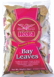
Heera Bay Leaves 10x50g - 1281