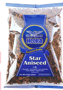
Heera Star Anis (Sternanis ganz) 20x50g - 1257