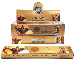
Heera Asli Oudh Agarbatti 12x15g - 1767