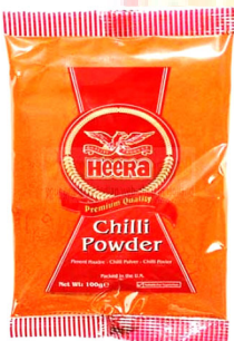
Heera Chilli Powder 20x100g - 1133