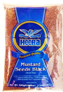
Heera Mustard Seeds (Black) 10x400g - 1218