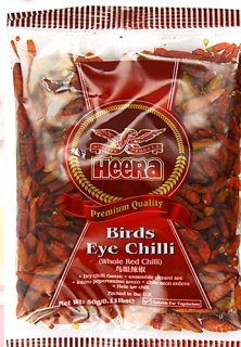
Heera Chilli Whole (Bird Eye) 20x50g - 1259