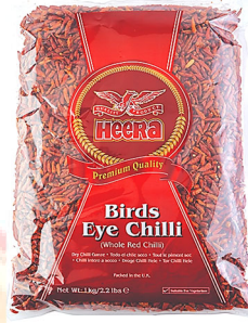
Heera Bird Eye Chilli 4x1kg - 1382