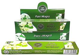
Heera Pure Mogra Agarbatti 12x15g - 1706