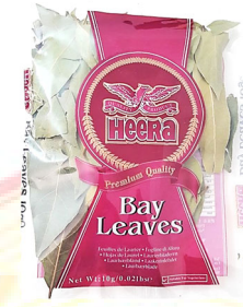
Heera Bay Leaves 20x10g - 1224