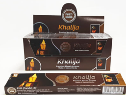
Heera Khalija Agarbatti 12x15g - 1768