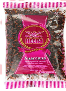
Heera Anardana (Granatapfel) Seeds - 20x100g - 1293