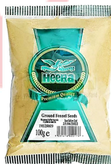
Heera Fennel Powder 20x100g - 1112