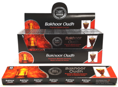
Heera Bakhour oudh Agarbatti 12x15g - 1701