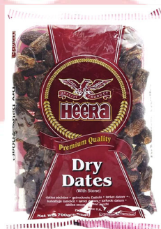
Heera Dried Dates 20x300g - 1309