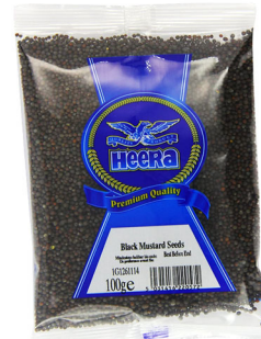
Heera Mustard Seeds (Black) 20x100g - 1215