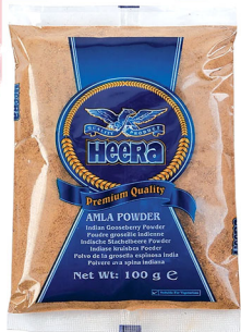
Heera Amla Powder 20x100g - 1845