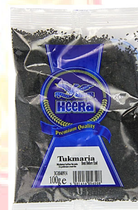
Heera Tukmaria 20x100g - 1423