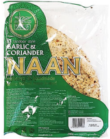
Heera Garlic Nan 14x2pck - 1646