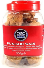
Heera Punjabi Wadi Amritsari Type (Jar) 12x300g - 1766