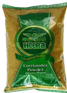
Heera Dhania Powder 10x400g - 1261