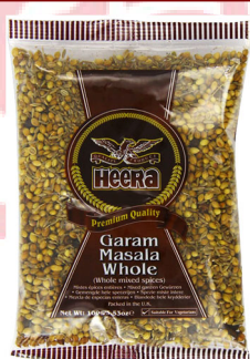
Heera Garam Masala Whole 20x100g - 1256