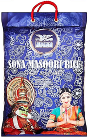
Heera Sona Masoori 10kg - 1139