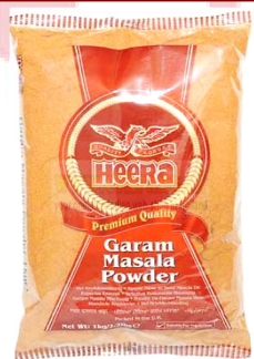
Heera Garam Masala Powder 20x100g - 1644