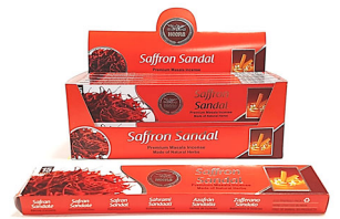
Heera Saffron Sandel Agarbatti 12x15g - 1710