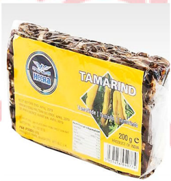
Heera Tamarind Seedless 60x200g -