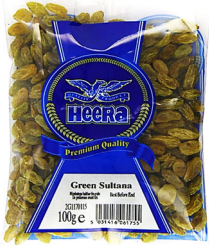
Heera Raisin Golden Sultana 20x100g - 1263