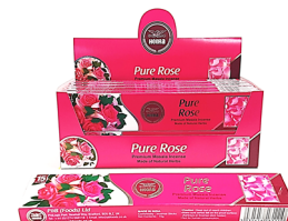
Heera Pure Rose Agarbatti 12x15g - 1712