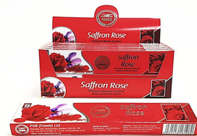
Heera Saffron Rose Agarbatti 12x15g - 1709