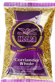
Heera Dhania Whole 10x300g - 784