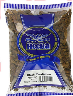
Heera Cardamon Black 20x50g - 1253