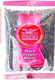
Heera Black Pepper Whole 20x100g - 1254