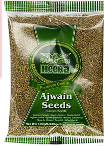
Heera Ajwain (Königskümmel) 20x100g - 1214