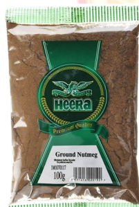
Heera Nutmeg Powder 10x100g - 1260