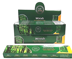
Heera Woods Agarbatti 12x15g - 1711