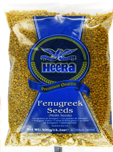
Heera Methi Seeds 6x1kg - 1658