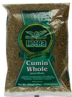
Heera Jeera Whole 10x300g - 1143