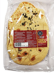
Heera Tandoori Style Plain Nan 14x2pck - 1648