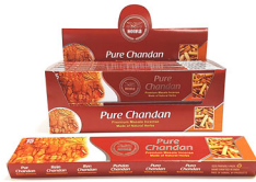
Heera Pure Chandan Agarbatti 12x15g - 1702