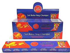
Heera Sai Baba Nag Champa Agarbatti 12x15g - 1707