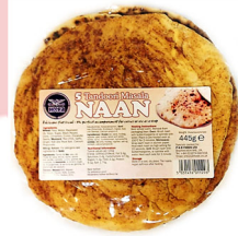
Heera Tandoori Masala Nan 12x445g - 1647