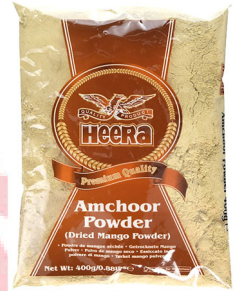
Heera Amchur Powder (mango) 20x100g - 1411