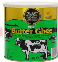
Heera Butter Ghee 12x1kg- 1204;12x500g-1098; 6x2kg-1099